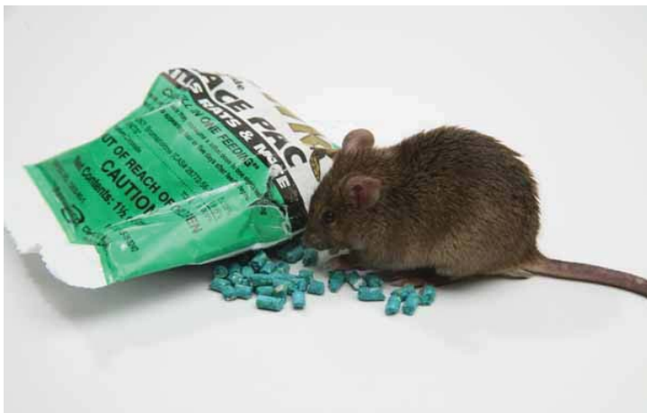
Mouse will open the pack