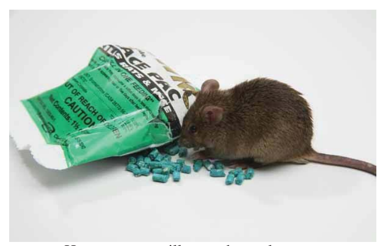
House mouse will open the pack