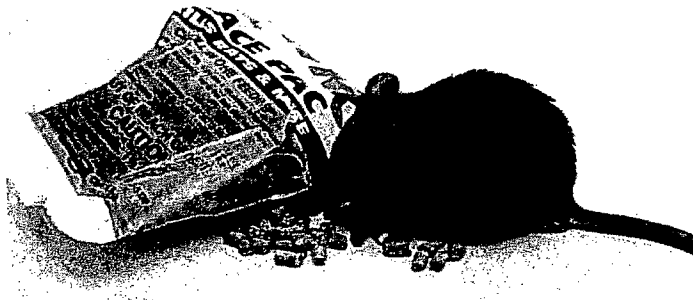
House mouse will open the pack