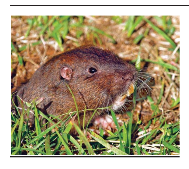
Rats, Mice, Meadow Mice, Deer Mice, & Kangaroo Rats