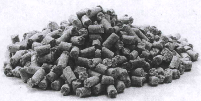
Photo is not representative of a bait placement