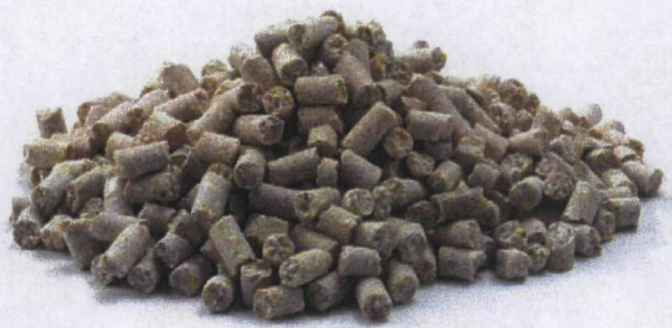
Photo is not representative of a bait placement