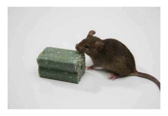
Picture not representative of Bait Placement. Bait stations are mandatory for outdoor, above-ground use.