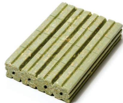
Photo Not Representative of a Bait Placement

Bold, italicized text is information for the reader and is not part of the label.