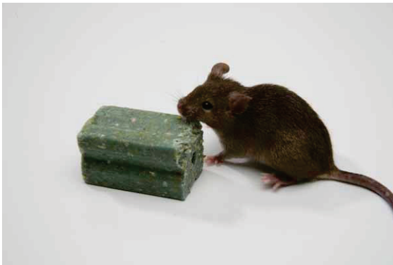
Picture not representative of Bait Placement. Bait stations are mandatory for outdoor, above- ground use.