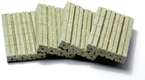
Photo Not Representative of a Bait Placement