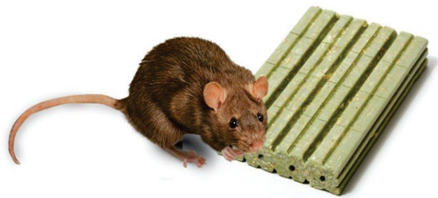
Picture not representative of Bait Placement. Bait stations are mandatory for outdoor, above- ground use.