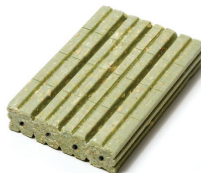
Photo Not Representative of a Bait Placement

Bold, italicized text is information for the reader and is not part of the label.