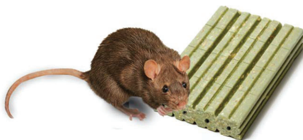
Picture not representative of Bait Placement. Bait stations are mandatory for outdoor, above-ground use.