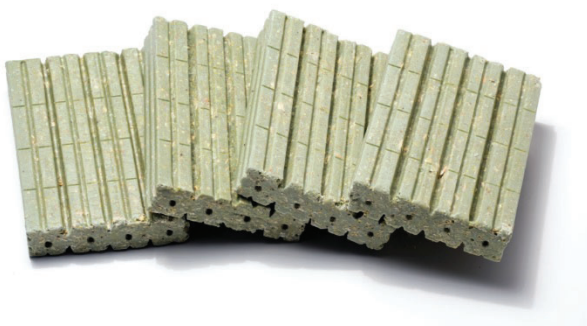
Photo Not Representative of a Bait Placement