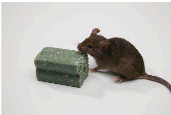
Picture not representative of Bait Placement. Bait stations are mandatory for outdoor, above-ground use.