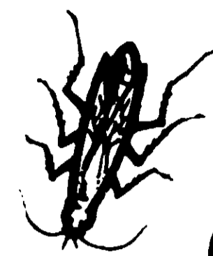
Kills WATER BUGS