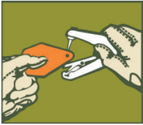
Figure 1. Disinfect pliers prior to use. Place female tag under clip by depressing lever. Collar on tag must be pointing down.

For adequate control of horn flies, attach one tag per animal. For optimum control of horn flies, control of ear ticks, and as an aid in the control of face flies, lice, stable flies, and house flies, attach one tag to each ear (two per animal). Replace as necessary. PATRIOT tags have been proven to be effective against pyrethroid resistant horn flies for up to five months. Apply as indicated (Figures 1-5). Calves less than 3 month of age should not be tagged as ear damage may result. Remove tag prior to slaughter.