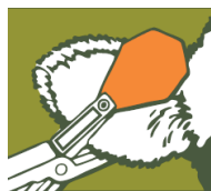
Figure 3 [and] Figure 4

Position tag on the inner flat surface in center of ear. Do not allow shaft of the male rivet to penetrate any cartilage rib or blood vessel or ear damage may result. We recommend that tag be rotated at a 90° angle (Fig. 3) for ease of application. Tag may also be extended outward from the plier in a straight manner (Fig. 4).