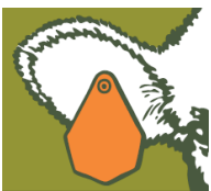
Figure 5. When properly positioned, the tag should hang as shown.

Position tag on the inner flat surface in center of ear. Do not allow shaft of the male rivet to penetrate any cartilage rib or blood vessel or ear damage may result. We recommend that tag be rotated at a 90° angle (Fig. 3) for ease of application. Tag may also be extended outward from the plier in a straight manner (Fig. 4).