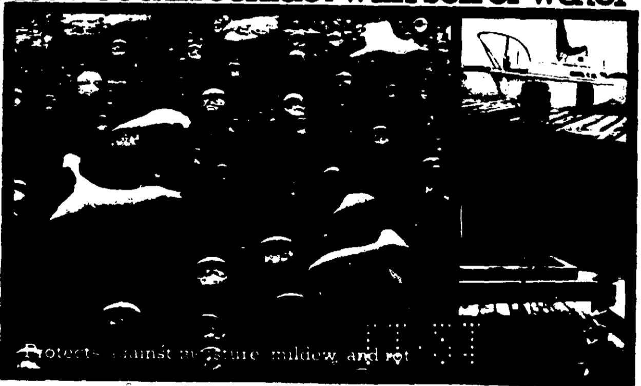
Protects against moisture, mildew, and rot

EVANS PRODUCTS COMPANY Roanoke, VA 24015