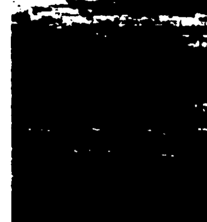
CHECKING Evans Pentalife controls checking which causes paint to split and peel.