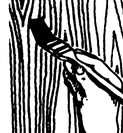
PAINTABLE Wood treated with Evans Pentalife is paintable.