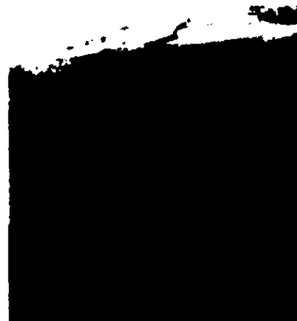
TERMITE DAMAGE Evans Pentalife kills wood destroying insects.