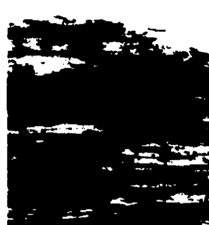
ROT & DECAY Wood treated with Evans Pentalife resists rot and decay.