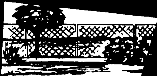
CONTROLS GROWTH UNDER FENCES.