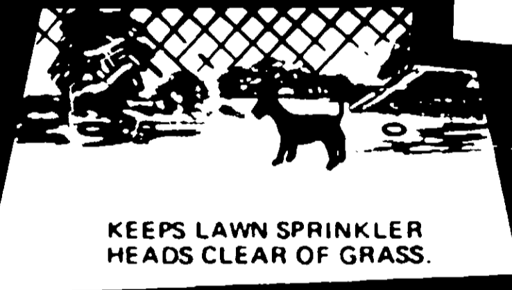
KEEPS LAWN SPRINKLER HEADS CLEAR OF GRASS.