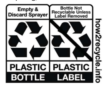
ABOVE GRAPHIC IS NEW 3

CONTAINER DISPOSAL: Non-refillable container. Do not reuse or refill this container. Clean container promptly after emptying. Triple rinse (or equivalent). Follow pesticide disposal instructions for rinsate. Then discard in trash or offer for recycling, if available.