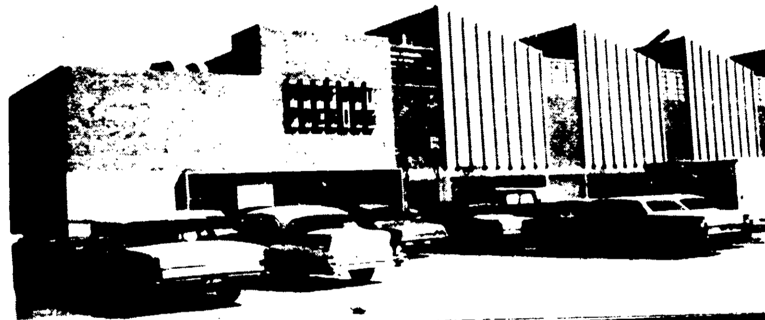
Monfort Packing Plant, Greeley, Colorado, "ULTRA MODERN" Killing & Breaking