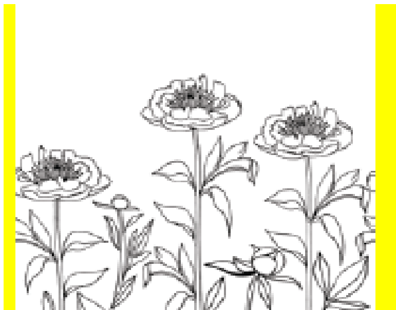
{Associated with Fresh Floral Scent}