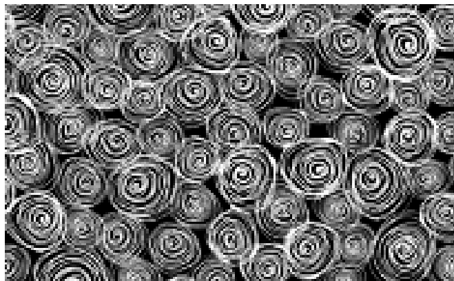
{Associated with Fresh Linen Scent}