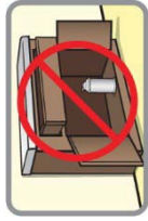
1" x 0.7"