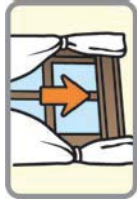
1" x 0.7"