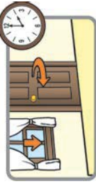
1.4" x 0.8"