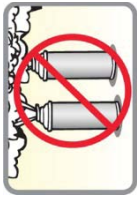
1" x 0.7"