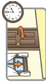
1.4" x 0.8"