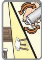
1" x 0.7"