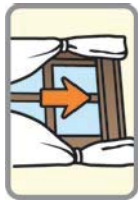
1" x 0.7"