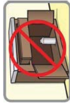
1" x 0.7"