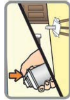
1" x 0.7"