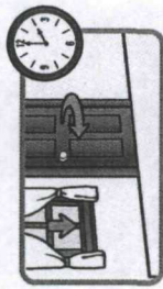
1.4" x 0.8"