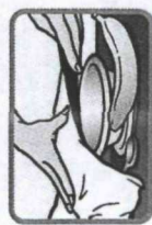
1" x 0.7"