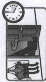
1.4" x 0.8"