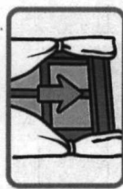
1" x 0.7"