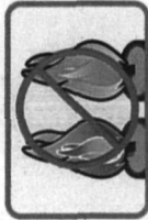
1" x 0.7"