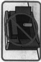
1" x 0.7"