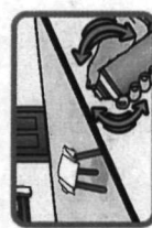
1" x 0.7"