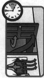
1.4" x 0.8"