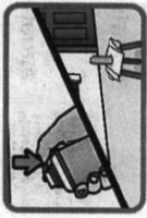
1" x 0.7"