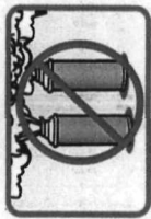
1" x 0.7"