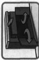
1" x 0.7"