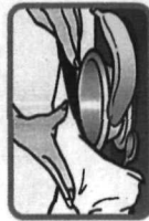
1" x 0.7"