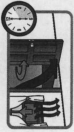
1.4" x 0.8"