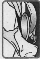
1" x 0.7"