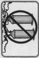
1" x 0.7"