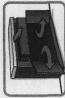
1" x 0.7"