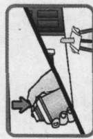
1" x 0.7"