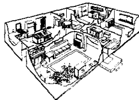
· Typical areas that may require insecticide treatment.

FOR HOUSEHOLD USE — INDOORS: Spray areas where cockroaches, Palmetto bugs, ants, clover mites, crickets, firebrats, waterbugs, silver-fish and spiders are found or normally occur including dark corners of rooms and closets, cracks and crevices in walls; along and behind baseboards; beneath and behind sinks, stoves, refrigerators and cabinets; around plumbing and other utility installations. For ants , apply to ant trails; around doors and windows and wherever else these pests may find entrance. For control of carpet beetles , thoroughly spray along baseboards and edges of carpeting, under carpeting, rugs and furniture, in closets and on shelving, and wherever else these insects are seen or suspected. For control of fleas and brown dog ticks , thoroughly spray pet beds, resting quarters, nearby cracks and crevices, along and behind baseboards, window and door frames and localized areas of floor and floor covering where these pests may be