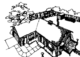
· Typical areas that may require insecticide treatment.

present. Old bedding of pets should be removed and replaced with clean fresh bedding after treatment of pet area. Do not treat pets with this product. To control the source of flea infestations, pets inhabiting the treated premises should be treated with a product registered for application to animals. Note: Check car-pet manufacturer's warranty and care and maintenance information before using product on your specific brand of carpeting. OUTDOORS: