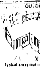
Typical areas that may require treatment