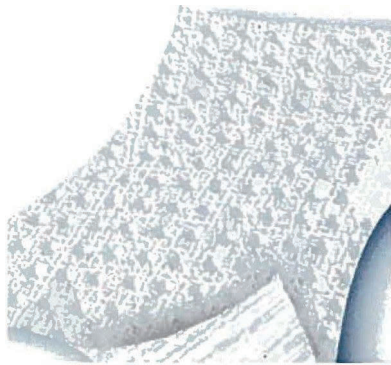
[One side scrubs] [One side wipes]

Will be used only if 1 minute Organisms on container label Does not apply to Norovirus