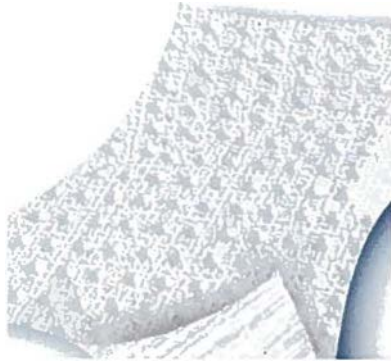
[One side scrubs] [One side wipes]

This graphic shows use of the wipe dispenser