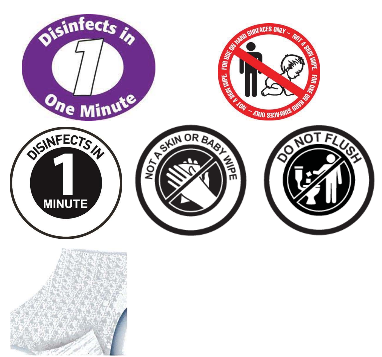
[One side scrubs] [One side wipes]