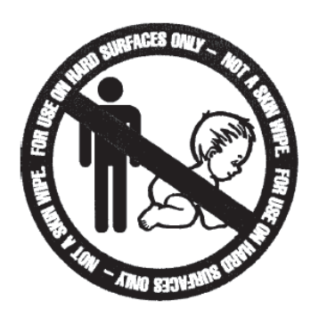
Not a Skin Wipe. For Use on Hard Surfaces Only.