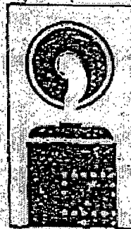
[This graphic shows use of the wipe dispenser.]