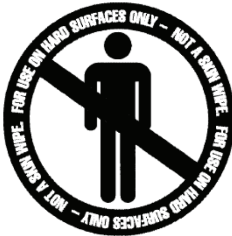
Not a Skin Wipe. For Use on Hard Surfaces Only.

THE INFORMATION IN BOX IS NOT PART OF THE LABELING [ ] - Statements in brackets are optional or instructional. Italicized words in brackets are not included A footnote can be used to list organisms. Bacteria and virus can be separated into footnotes 1 and 2 if desired. When organisms are listed next to a claim, the organisms may be listed in a footnote instead of directly next to the claim +All pesticidal "germ" claims must be linked to bacteria (minimum: Salmonella and Staph) and at least one virus. For example: Front panel: "Kills germs+" Back panel: "+Kills Salmonella enterica, Staphylococcus aureus, Herpes Simplex Type 2, and Influenza A/Hong Kong" Sequence and placement of phrases is optional unless specified in 40 CFR 156.10. Capitalization, plurals or singular, bold and italics are all variable unless specified in 40 CFR The terms "Wipe(s)", "Towel(s)", "Towelette(s)" and "Cloth(s)" can be used interchangeably throughout except for the product primary brand name which can be only changed by notification or amendment. The word "and" and symbol "&" can be used interchangeably All directions may be written in numbered form or in paragraph form April 4, 2019