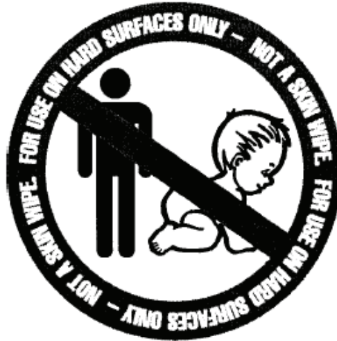
Not a Skin Wipe. For Use on Hard Surfaces Only.