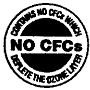
[For Reviewer: Optional - CFCs logo]

www.CBProProducts.com [For Reviewer: Optional text]