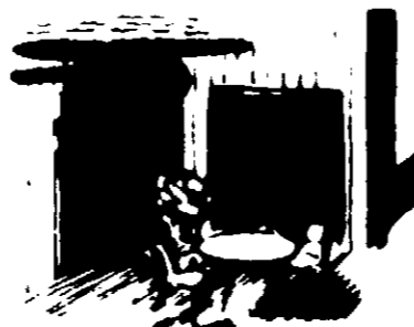
PATIO - FURNITURE