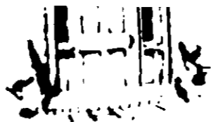
DOOR JAMBS AND SILLS