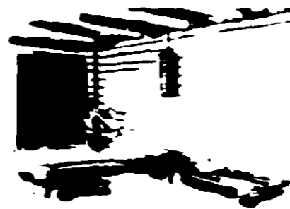
ROUGH CUT SIDING