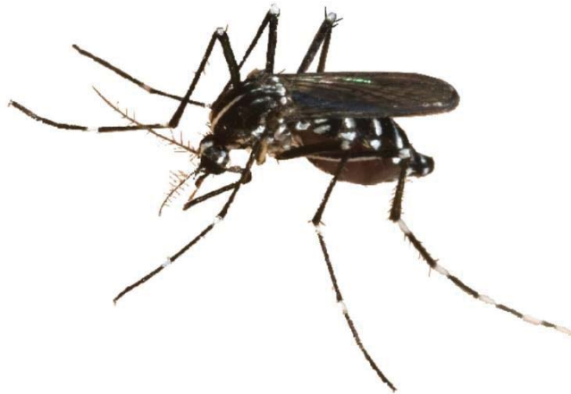
ASIAN TIGER MOSQUITO