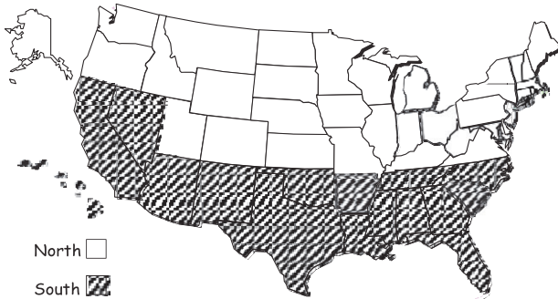
Use "Regions" within the United States

For post emergent crabgrass control, apply this product at the recommended rates when crabgrass is small (3-4 leaf). This product will not control large tillered crabgrass. Applications will control existing crabgrass and prevent further emergence.