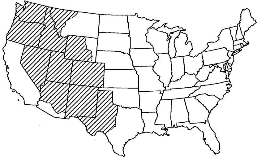
Headline Use Area Map - Barley 14-Day PHI

Barley may be harvested 14 days after the last application in the following states: AZ (north of I-10), CO, ID, MT (west of Rt 87/I-15), NV, NM, OR, TX (west of Rt 283/377), UT, WA , and WY (west of I-25/I-90), as shown in the Headline Use Area Map, 14-Day PHI in barley.