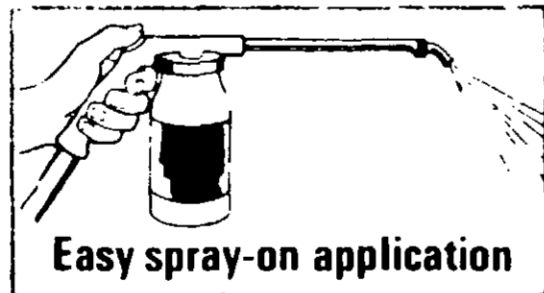
Easy spray-on application

Controls Common Ornamental Diseases Roses: Black Spot Blossom Blight Iris: Leaf Spot Geraniums: Botrytis Blight (Leaf Spot) Chrysanthemums: Ray Blight, Gray Mold and certain other diseases.