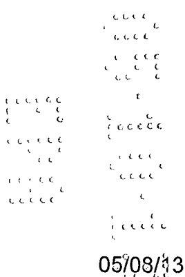
Page 6 of 27

HYDROTHERAPY TANKS - Add 1.5 oz. of this product per 1000 gallons of water to obtain a chlorine residual of 1 ppm, as determined by a suitable chlorine test kit. Pool should not be entered until the chlorine residual is below 3 ppm. Adjust and maintain the water pH to between 7.2 and 7.6. Operate pool filter continuously. Drain pool weekly, and clean before refilling.