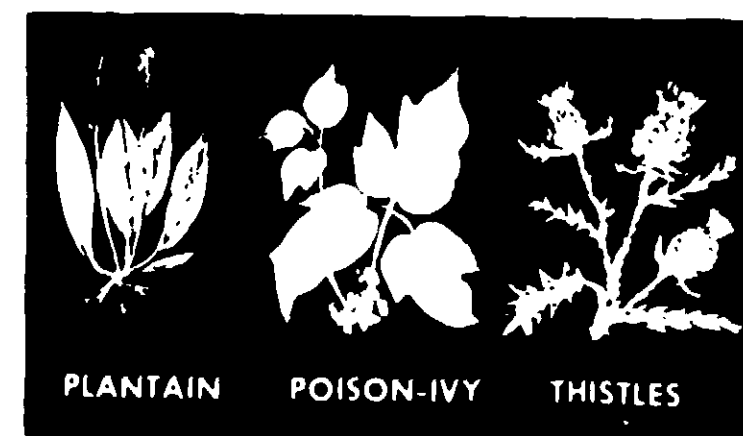
PLANTAIN POISON-IVY THISTLES