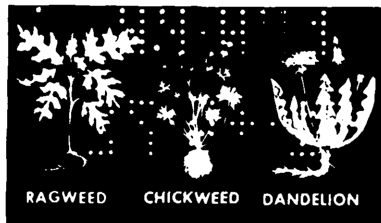
RAGWEED CHICKWEED DANDELION