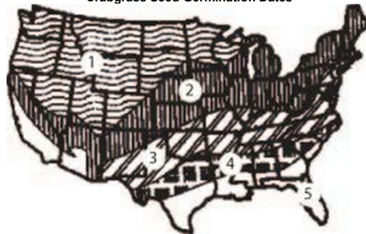
Crabgrass Seed Germination Dates