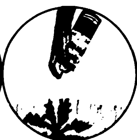
EASY TO APPLY