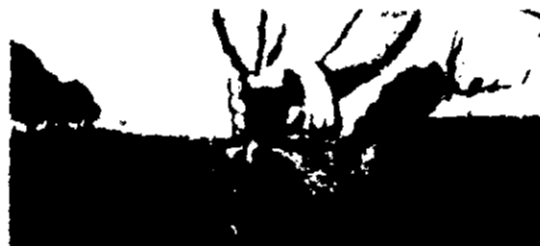
FOR BAREROOT & TRANSPLANTING