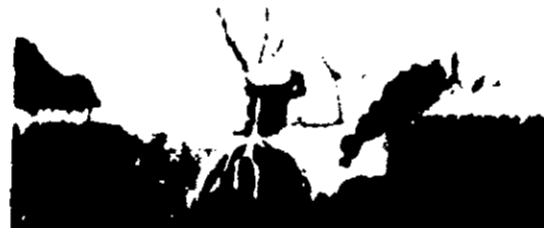
FOR BAREROOT & TRANSPLANTING