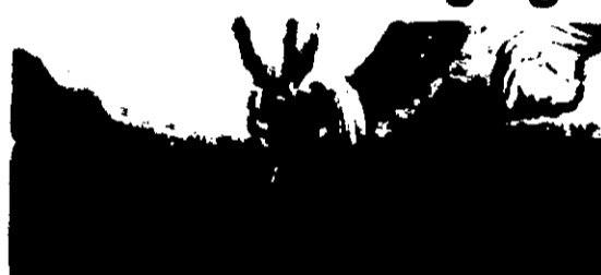
FOR BAREROOT & TRANSPLANTING