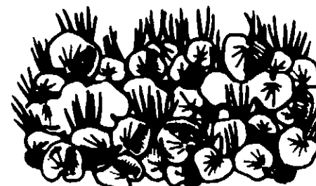
ANNUAL BLUE GRASS

CAUTION: KEEP OUT OF REACH OF CHILDREN AND PETS. SEE LEFT PANEL FOR ADDITIONAL DIRECTIONS.