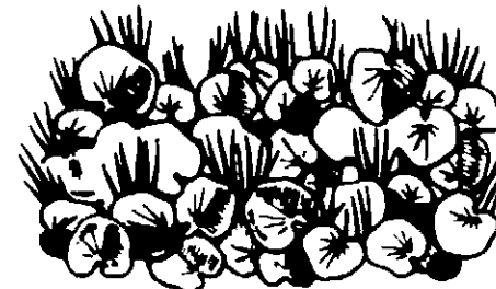
ANNUAL BLUE GRASS

CAUTION: KEEP OUT OF REACH OF CHILDREN AND PETS. SEE LEFT PANEL FOR ADDITIONAL CAUTIONS.