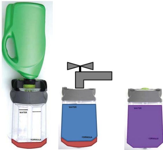
(STEPS 1, 2, 3 optional pictogram)