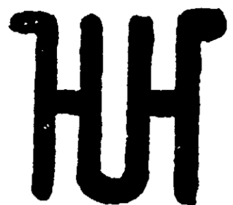
H U H CONNECTED