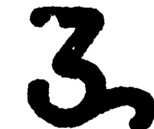
3 LAZY B