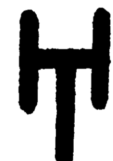
H OVER T