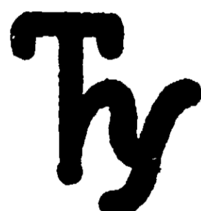
T H B CONNECTED