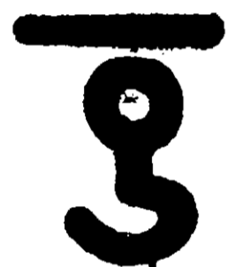
BAR BUTTON MARK