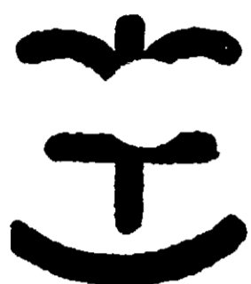
EUR DE LID JARTER CIRCLE