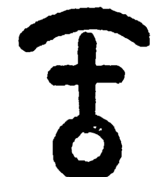
QUARTER CIRCLE CROSS O