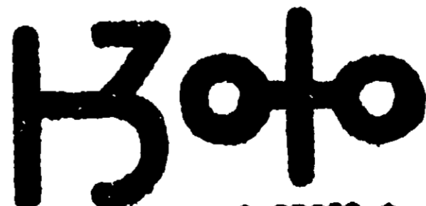
H THREE O CROSS O