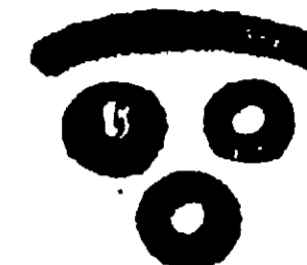
QUARTER CIRCLE THREE CIRCLE