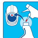
Align Tip to Tube