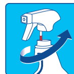
Twist Off, Refill