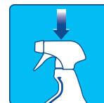
Push Down to Close