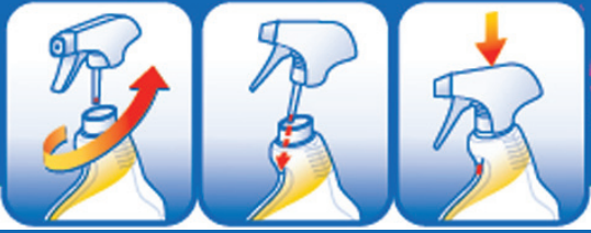
Twist off, Refill Align Tip to Tube Push, Snap to Close

Twist trigger on spray bottle counterclockwise and pull upward to remove. Refill spray bottle. To replace trigger, align red tipped tube on trigger over tube opening inside of the bottle. Press straight down on the trigger until it clicks into place.