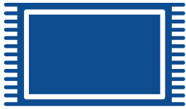
Carpets, Upholstery & Mattress Stains