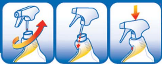
Twist off, Refill Align Tip to Tube Push, Snap to Close

Twist trigger on spray bottle counterclockwise and pull upward to remove. Refill spray bottle. To replace trigger, align red tipped tube on trigger over tube opening inside of the bottle. Press straight down on the trigger until it clicks into place.