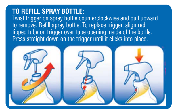
Twist off, Refill Align Tip to Tube Push, Snap to Close