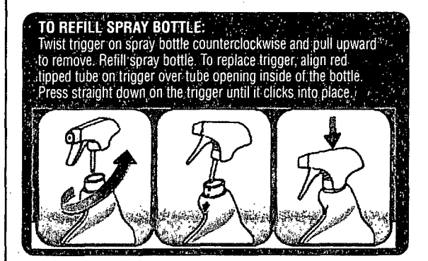
Twist off, Refill Align Tip to Tube Push, Snap to Close